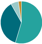
Allocation of underlying funds*